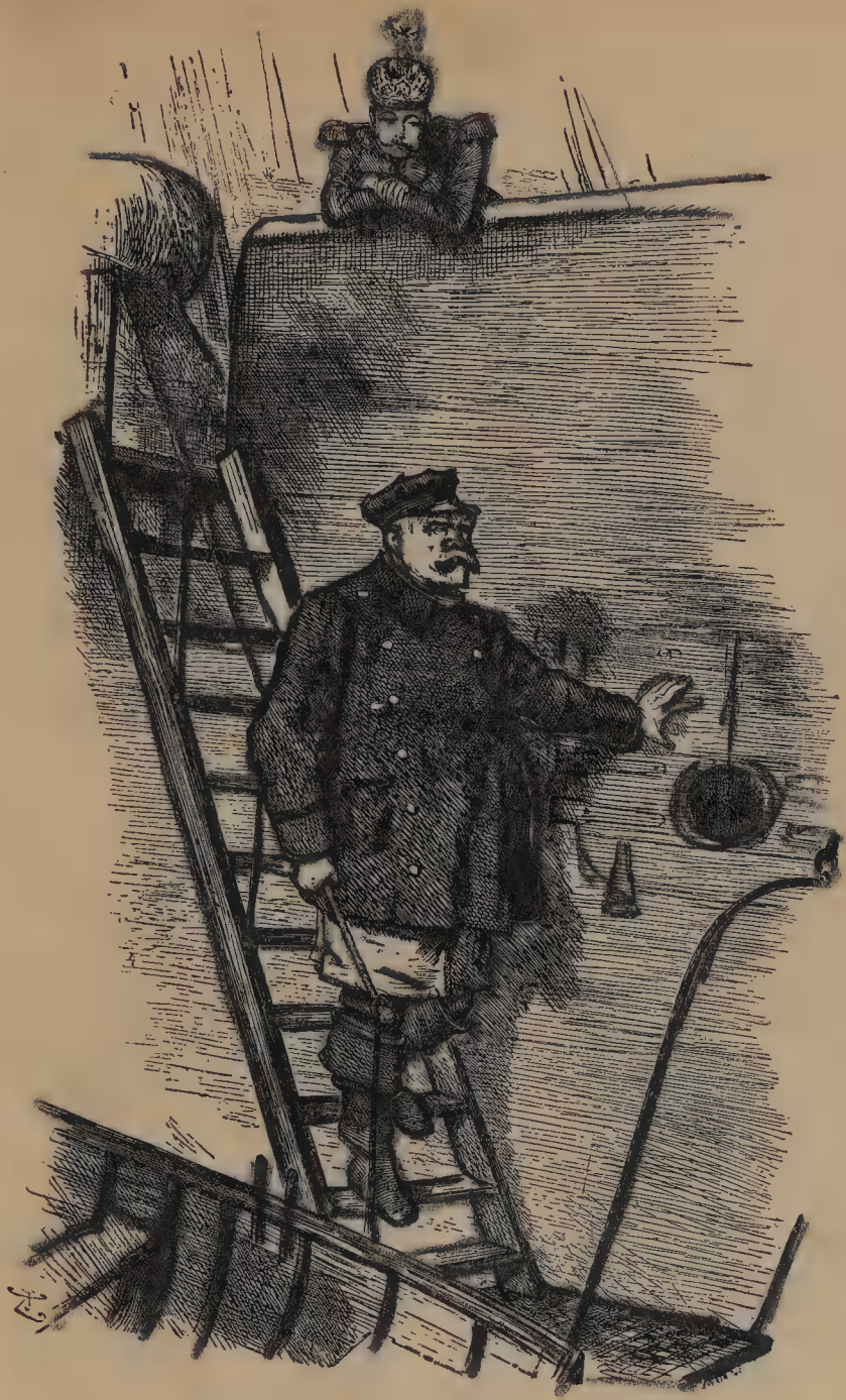
“DROPPING THE PILOT” —ONE OF THE MOST FAMOUS CARTOONS EVER DRAWN—WHICH APPEARED IN “PUNCH” MARCH 29, 1890, A WEEK AFTER BISMARCK’S DISMISSAL. WHEN THE GERMAN SHIP OF STATE CRASHED ON THE ROCKS UNDER THE UNSKILLED HELMSMANSHIP OF THE KAISER, THE CARTOONIST’S PROPHETIC CONCEPTION OF THE SIGNIFICANCE OF THE EPISODE ILLUSTRATED RECEIVED STRIKING CONFIRMATION